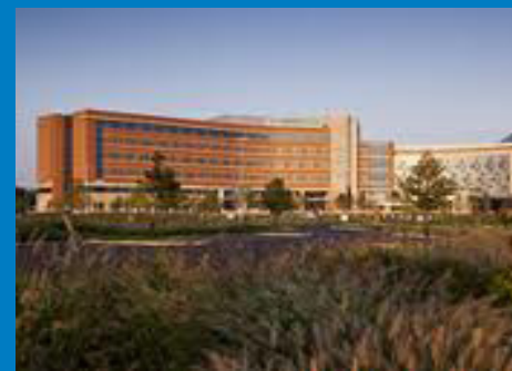
capital health pennington

FOR MORE INFORMATION OR A PRIVATE SHOWING: