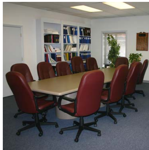
Large Board Room