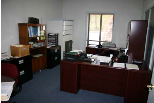
Executive Corner Office