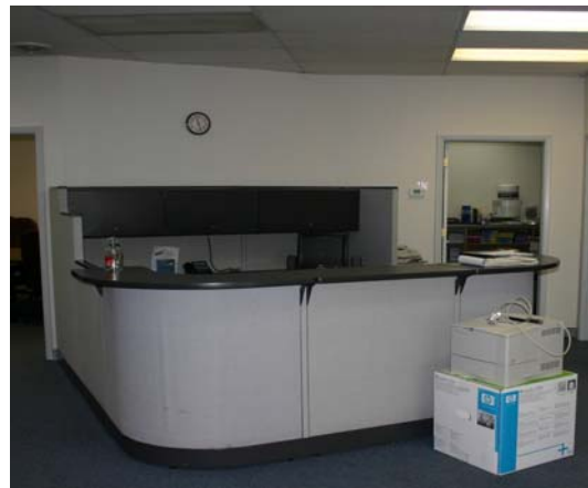
Built-in Reception Desk