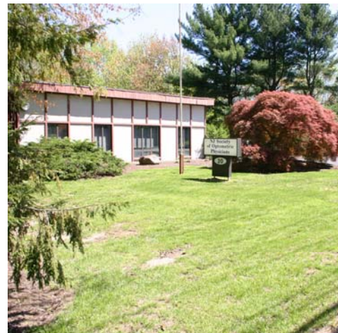
Exterior from Street