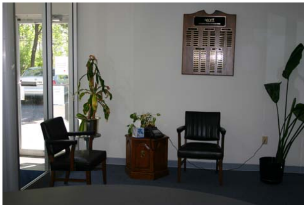
View From Reception Area