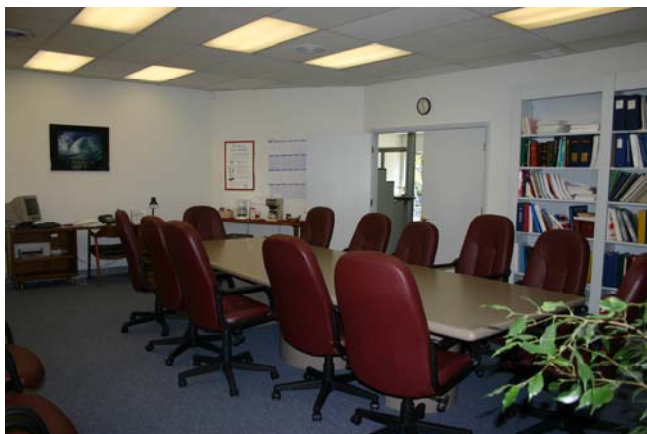
Large Board Room